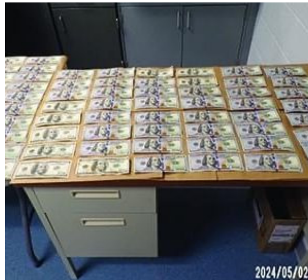
Cash found Thursday, May 2, in restroom of the KFC restaurant in Marysville.

Police have yet to determine if the incidents are connected, but are working with the Ohio Bureau of Criminal Investigation and the U.S. Secret Service to