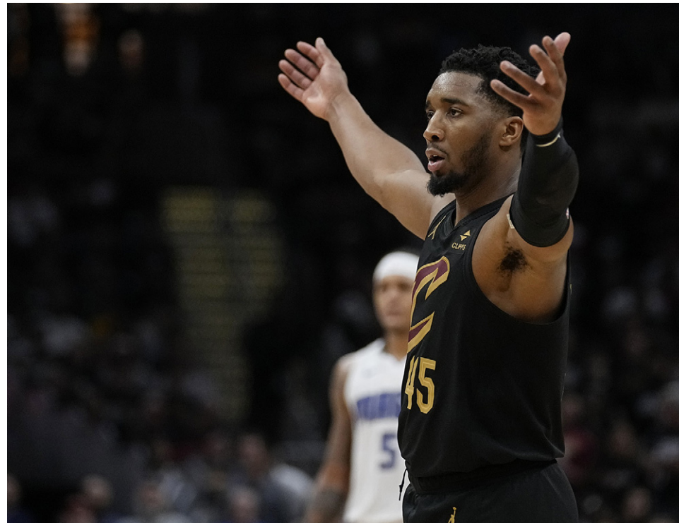
Cleveland Cavaliers guard Donovan Mitchell gestures to the crowd in the second half of Game 7 of an NBA basketball first-round playoff series against the Orlando Magic on Sunday in Cleveland.

"I don't mean this disrespectful, but it doesn't really mean much," Mitchell said. "We didn't come in just to win the first