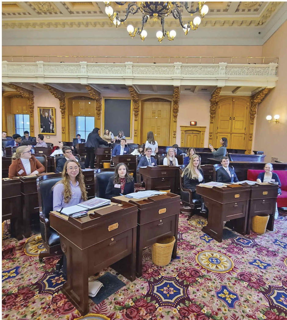
Calvary Christian students are pictured on the House floor at the statehouse on the first day of the YLA event.