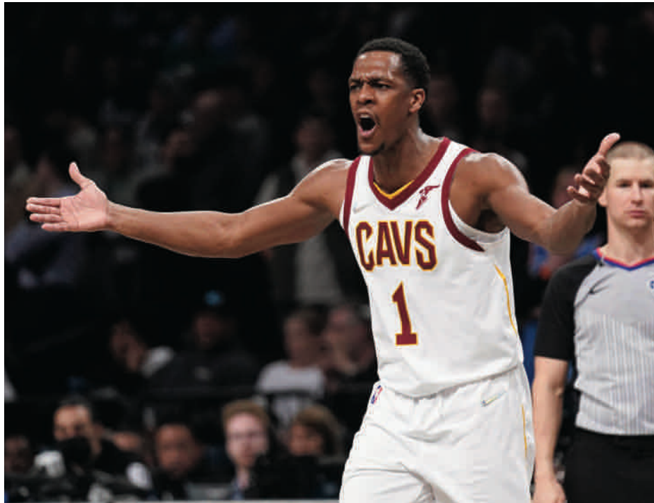
Cleveland Cavaliers' Rajon Rondo reacts to a call during the second half against the Brooklyn Nets in the opening basketball game of the NBA play-in tournament Tuesday in New York. THE NETS WON 115-108.

"Obviously, it starts with Trae Young," he said. "What he does impacts everybody else and his ability to one, make all the shots from all over the floor, two, to make all the plays with the ball in his hand, the passes and then that pick-and-roll game that they run."