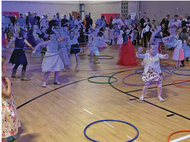
the music room, a fun photo booth in the cafeteria and refreshments.

The father-daughter dance dates back several years. Attendees also enjoyed a formal photo in