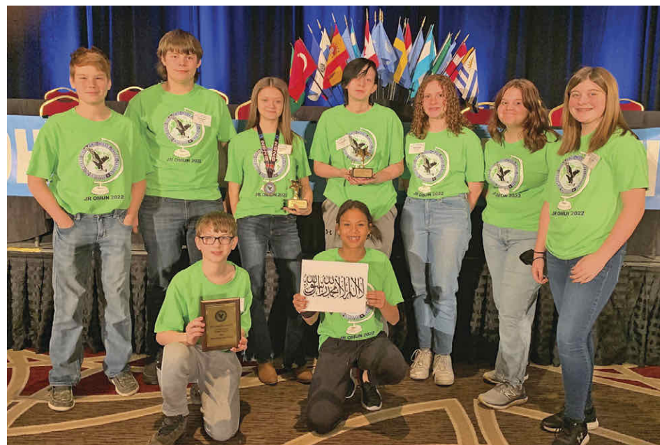
Riverside Schools' Junior Ohio Model United Nations team is pictured after the last General Assembly at the conference.