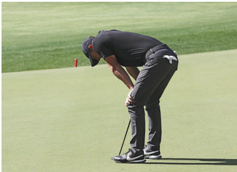
Rory McIlroy reacts after bogeying the 18th hole on the first day of play at the Valero Texas Open at TPC San Antonio on Thursday.

had a 1-over 73. After holding a bunker shot for eagle on his 11th hole and fol-