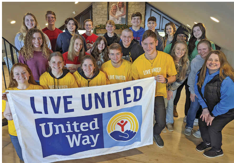
The 2022 Student United Way committee met this week at Discovery Riders and collaborated together to determine the criteria for spending their $25,000.

"We hope to receive ideas that are practical, things that are actually going to work, that will make a difference and will help with the sub-