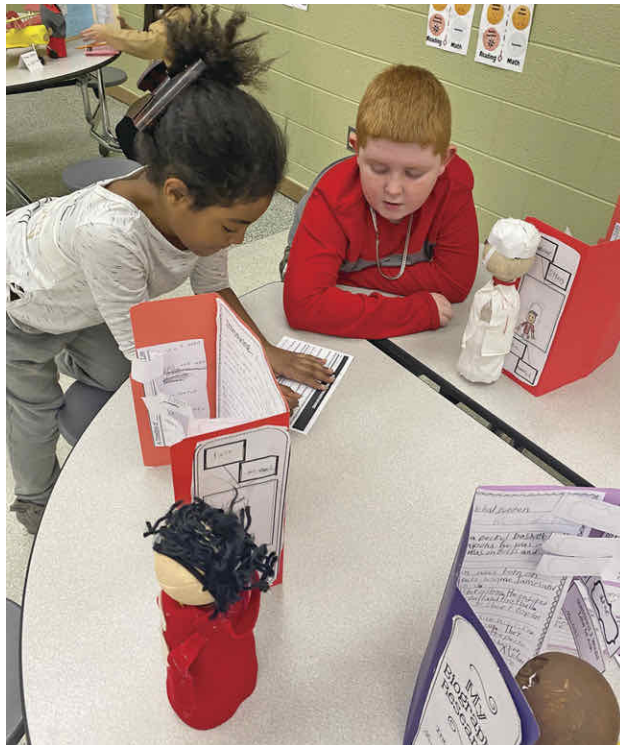
Bellefontaine Intermediate third-graders display their biography projects in the cafeteria. (BCS PHOTO)

Each pop bottle project was put in a showcase at the school.