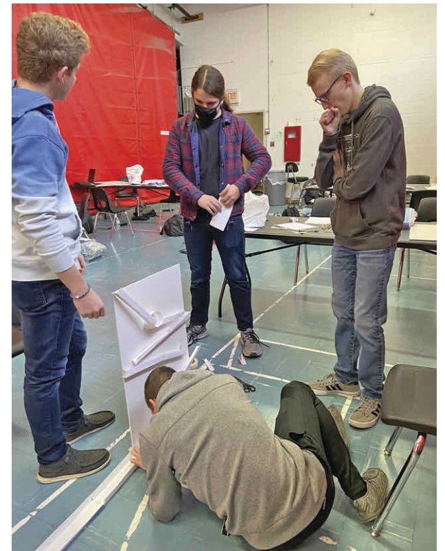
Bellefontaine High School students work together in the TEAMS competition.