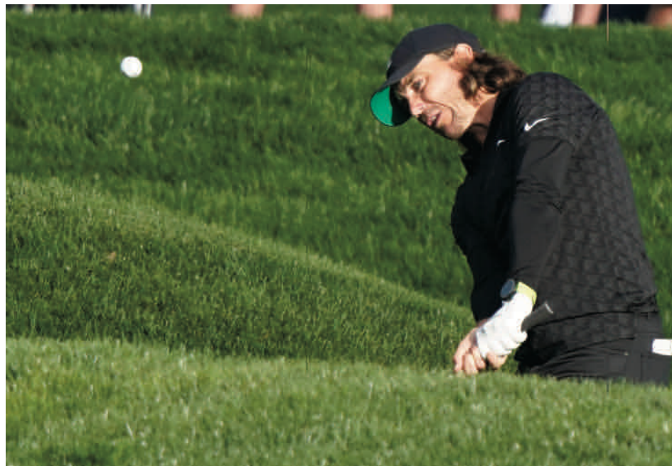
Tommy Fleetwood hits to the green on the 9th hole during the first round of play in The Players Championship golf tournament Thursday, March 10, 2022, in Ponte Vedra Beach, Fla.

ideal weather with no delays for nine weeks in four states across five time zones to start the year. And for the richest event in golf, with the strongest and deepest field of the year, it barely got started.